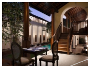
THE GALLE FORT HOTEL

Dinner at Cape Weligama Saturday 15th / 6.30 p.m