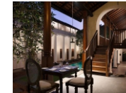
THE GALLE FORT HOTEL