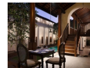
THE GALLE FORT HOTEL