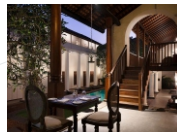
THE GALLE FORT HOTEL