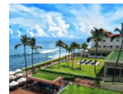
GALLE FACE HOTEL