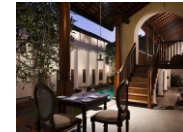
THE GALLE FORT HOTEL