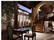
THE GALLE FORT HOTEL

Dinner at Cape Weligama Saturday 15th / 6.30 p.m